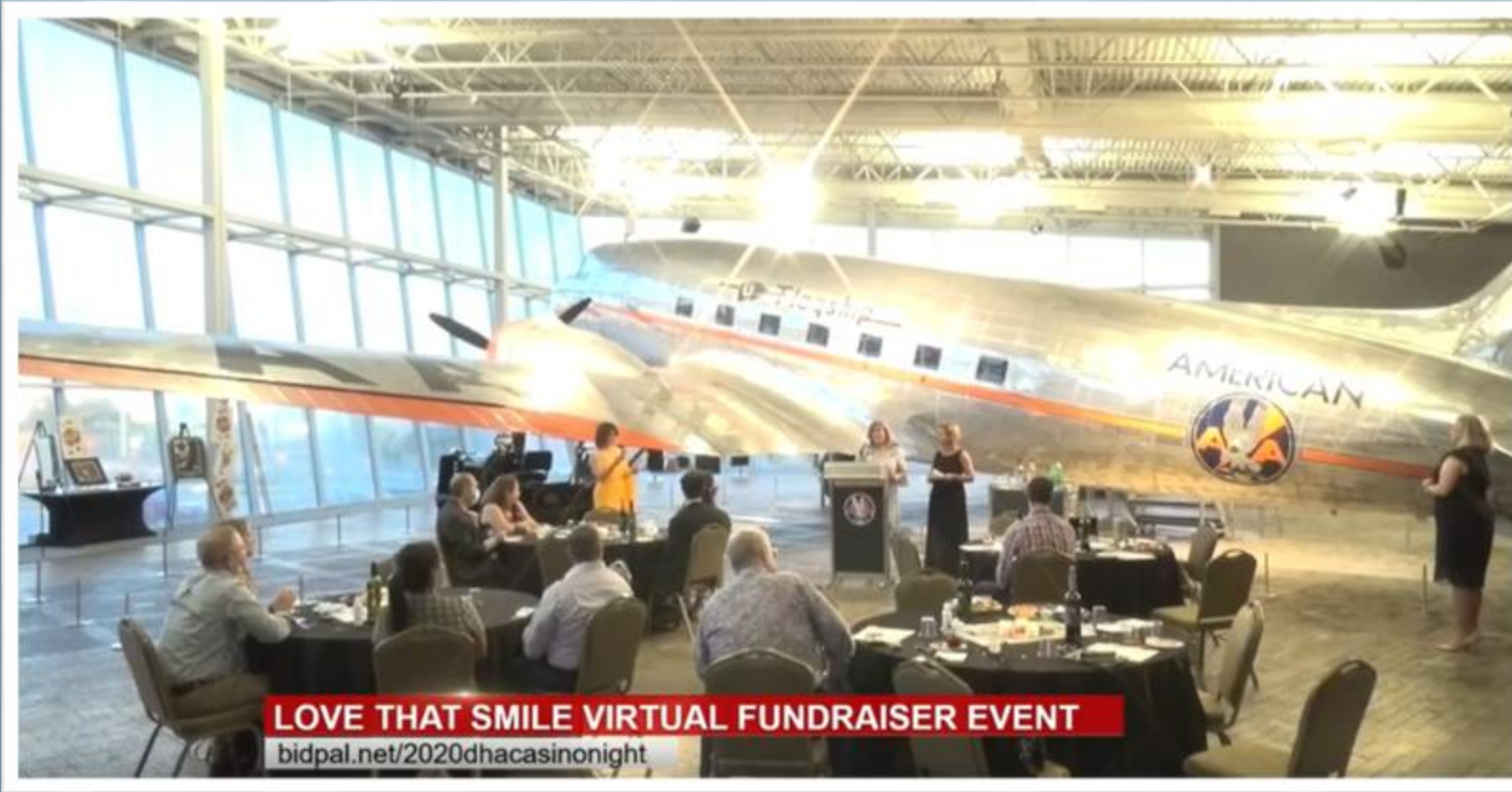
Virtual Livestream Experience