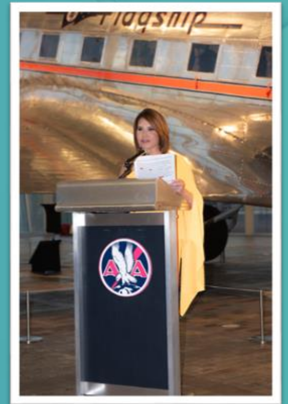
Live In-person MC