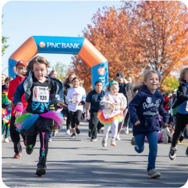
THON 5K powered by PNC