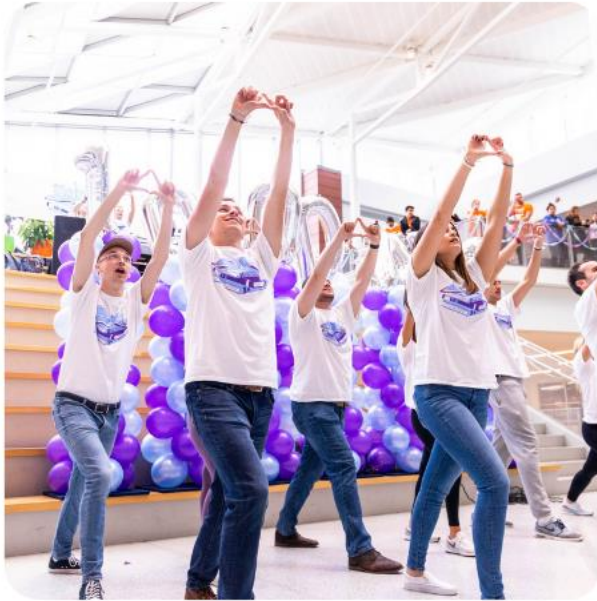
100 Days 'Til THON